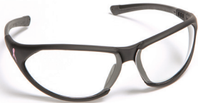
NBCF20E - CLEAR