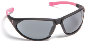
NBCF26E - SMOKE