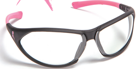
NBCF25E - CLEAR