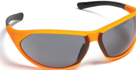
NBCF23E - SMOKE