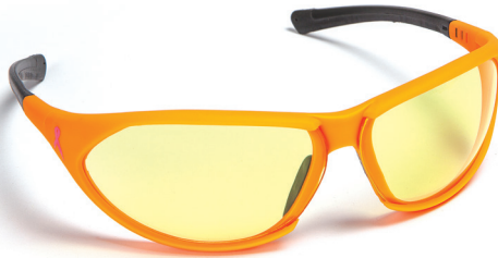
NBCF24E - AMBER