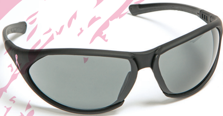
NBCF21E - SMOKE