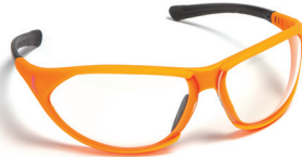
NBCF22E - CLEAR